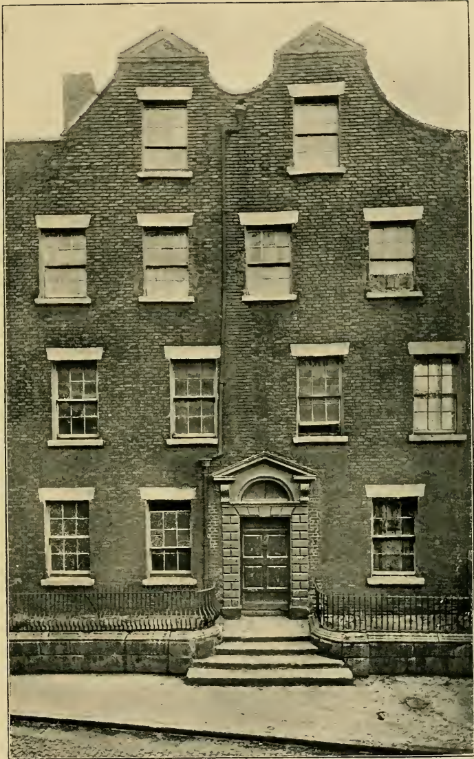
OLD HOUSE IN JERVIS STREET, DUBLIN.